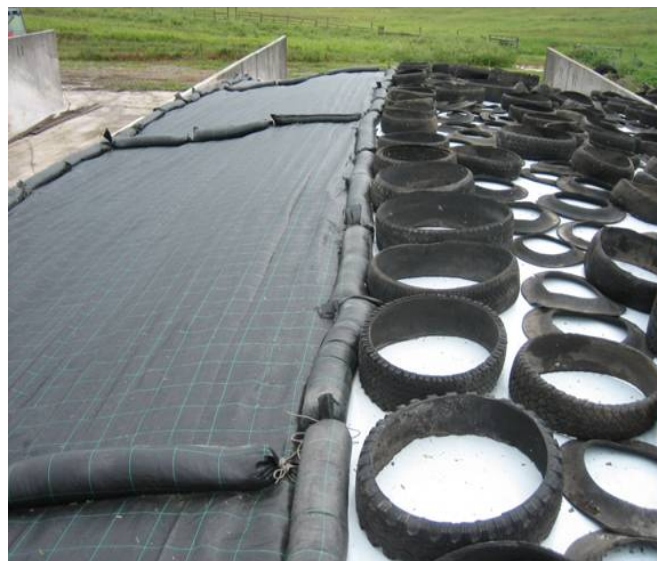
Figure 1. Picture of a bunker silo with two covering treatments. Left: Plastic on the side wall, low oxygen barrier plastic on silo, reusable protective tarp and gravel bags. Right: Normal 6 mil plastic with tires. (McDonnell and Kung, 2006).

Corn silage was sampled after 5 months of ensiling. Blocks of silage were taken at three heights extending in 15.24 cm increments downward, and three sampling widths extending in 20.32 cm increments outward from the wall (Figure 2). This sampling scheme yielded 9 “blocks” in total that were 20.32 cm × 20.32 cm × 15.24 cm, and was replicated twice, per time-point, per treatment.